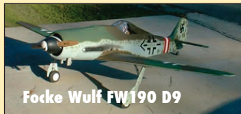
Focke Wulf FW190 D9