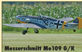
Messerschmitt Me109 G/K